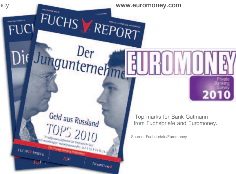
Top marks for Bank Gutmann from Fuchsbriefe and Euromoney.